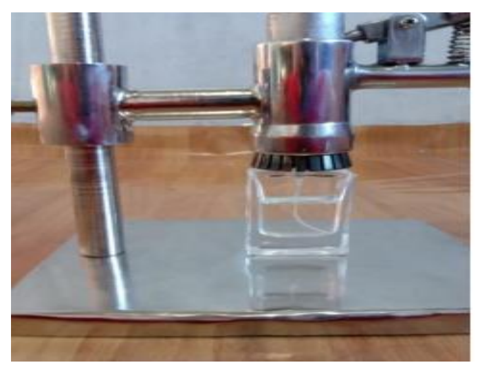
Fig. 8. Press Eye Height After Adjusting

After a series of tests have been carried out, the results obtained are arranged in tabular form to facilitate data analysis and interpretation. The table summarizes the performance of the tool based on predetermined criteria, namely resistance to leaks and the ability of the tool to install the sprayer on bottles at different heights. The data presented in this table provides a comprehensive picture of the effectiveness and efficiency of the tools tested. The following Table 2 shows the results of the tests that have been carried out.