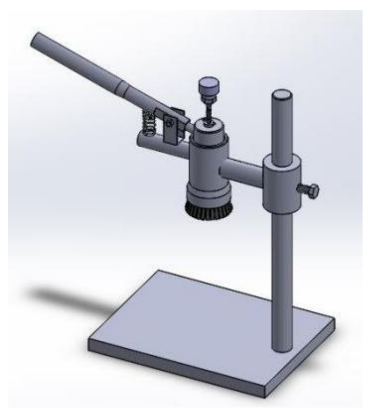
Fig. 2. Design of Perfume Bottle Crimping Sprayer Press Tool

In this research on the production process, technical drawings have a very important role because they function as the main guide in manufacturing and assembling components. Technical drawings are used to determine the dimensions and detailed specifications of each part of the tool or product to be produced. In this research, the author used SolidWorks 2017 drawing design software to design a press-crimping sprayer for perfume bottles [7]. The aim of making technical drawings for press crimping tools is to clearly illustrate the shape, size, and function of each component, making it easier for readers to understand the technical specifications of the tool and simplifying the manufacturing and assembly process. The results of the tool design can be seen in Fig. 2 .