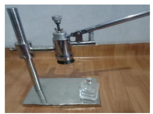
Fig. 6. Result of tool assembly

After the assembly process is complete, this tool takes its final shape after all components are joined together using bolts and nuts. A visual representation of the assembled tool can be seen in Fig. 6 .