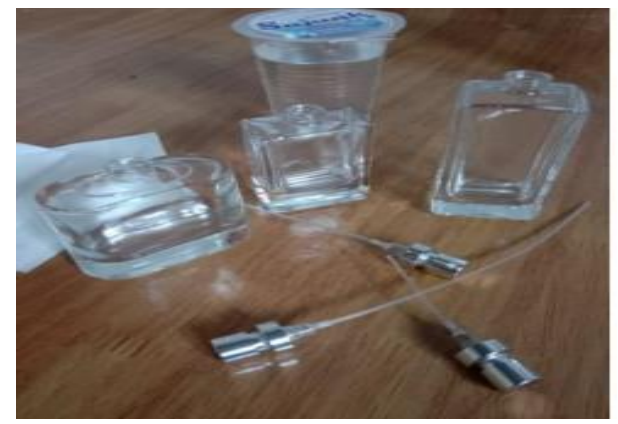
Fig. 7. Testing Materials