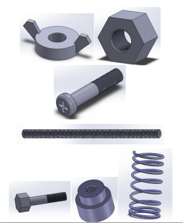
Table 1. shows the components used to make a perfume bottle sprayer crimping press tool. After determining these components, the next step is to carry out calculations in the design to ensure the tool functions as expected. This calculation includes an analysis of material strength, a determination of component dimensions, and an evaluation of the force required for the crimping process. With correct calculations, it is hoped that the tool can work optimally and efficiently in installing the sprayer on the perfume bottle.

8 These complementary function components as complementary tools when assembled and have different functions and positions. These components are not produced because they are already circulating on the market and are easy to find with predetermined standard parts such as bolts, nuts, threaded rods, hexagon bolts, knurled thumb nut and spring