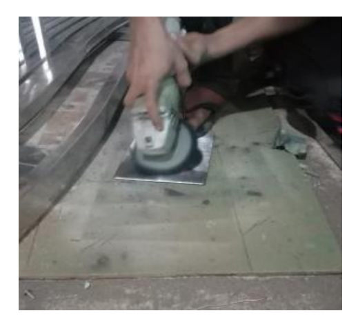
Fig. 5. Grinding process

The process of making this tool involves several important stages. First, use a milling machine to process flat objects, especially in forming flat sides on cylindrical objects. Next, cutting is carried out using a grinder to achieve dimensions that meet the required specifications. The tool assembly process involves welding with a TIG (tungsten inert gas) welding machine, which was chosen because the basic component used is stainless steel, so it requires welding with argon gas to maintain the strength and durability of the material. After the work stage is complete, polishing is carried out using a grinding machine with a polishing wheel and green stone (langsol) as the medium, with the aim of restoring the original color and shine of the stainless steel a fter the work process is complete. The grinding process can be seen in Fig. 5 .